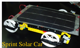
Sprint Solar Car